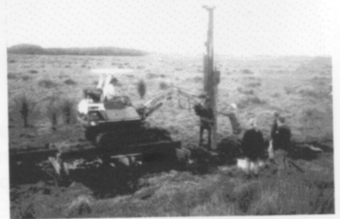
Pile driving near Anne Flanagan Dell.

Contractors have recently finished driving piles in the Anne Flanagan Dell area. This track will link the existing track to the Telecom reclamation land.