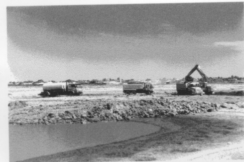
Laings working on the Central Ponding area, March 1999-10-20