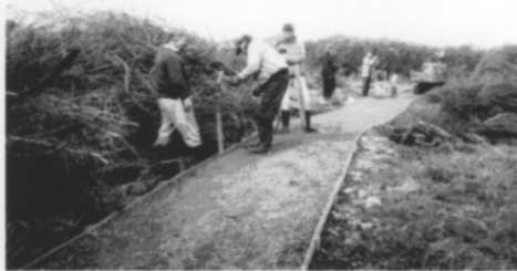
Te Roopu tu Tangata work on the track towards the viewing platform.