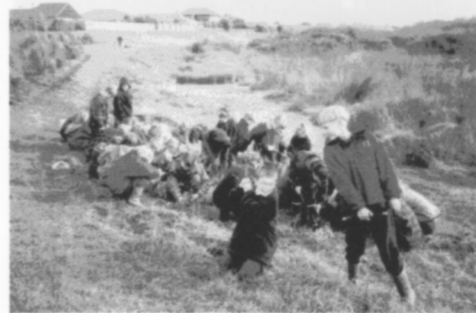
Windsor School Arbor Day planting near Clarevale Reserve.

carpark, 9am. Don't forget the gumboots - other equipment provided.