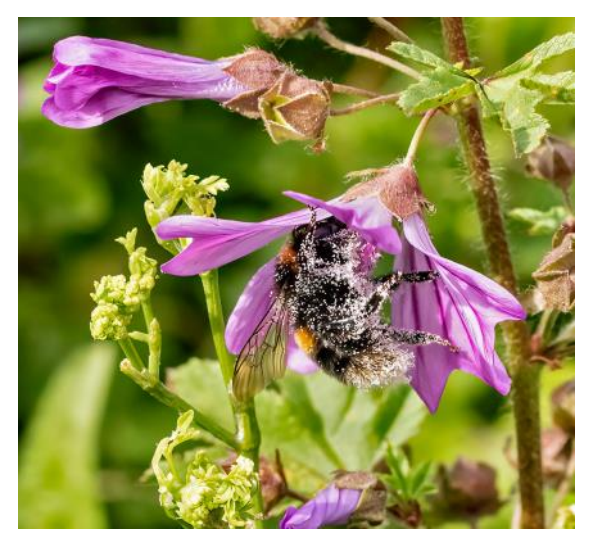
Bumble Bee, Bombus terrestris