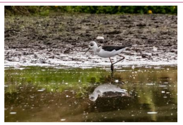
Poaka, juvenile Pied Stilt

Travis Wetland Trust—working with the Christchurch City Council to restore and enhance Oruapaeroa/Travis Wetland